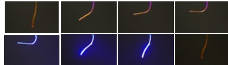
Reversible bending behavior of photoresponsive materials

PRIME will synthesize and design smart materials for additive manufacturing of mechanically active elements as actuators